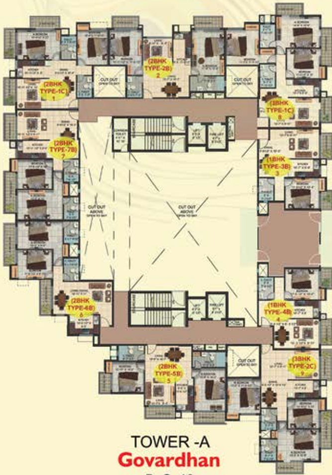
TOWER -A Govardhan B+G+16 (Ground Floor Plan)