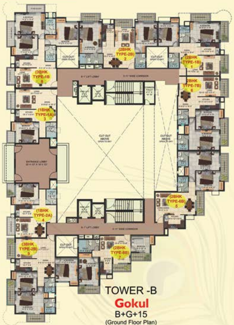
TOWER -B Gokul B+G+15 (Ground Floor Plan)