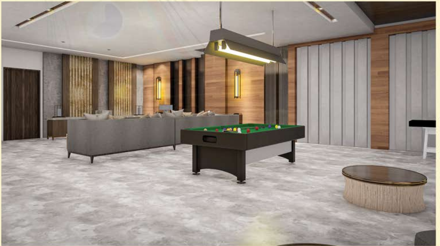
SITTING AND CLUB HOUSE